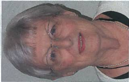
Ann Earl Letter 10/28