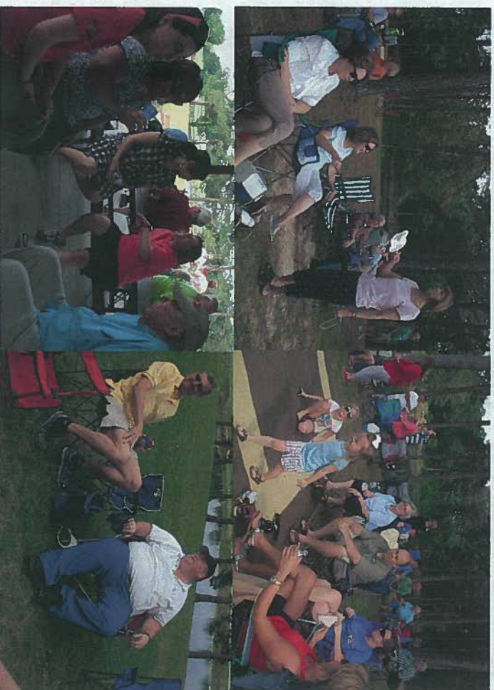
Scenes from the Church Picnic - April 27